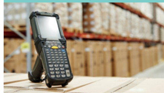
Goods reception and inventory control with efficient flow throughout the factory