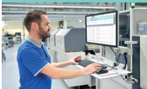
Operator solution for complete control with registration and follow-up