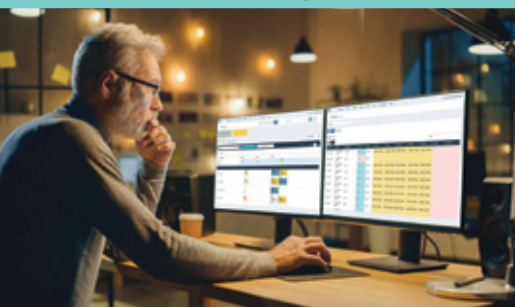
Automated and manual planning for optimal capacity utilisation